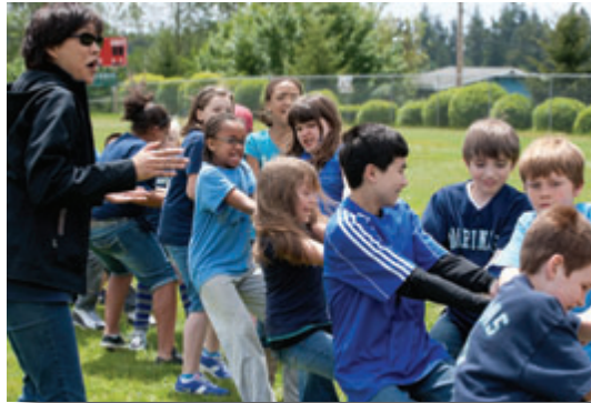
Elementary Field Day on June 7 proved to be an exciting and fun-filled day for K-6 students