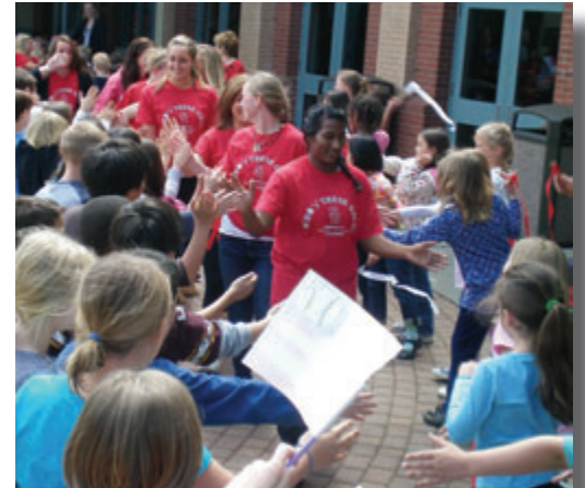
Elementary students give a Warrior send off to the Varsity Girls' Softball Team as they head to Yakima for the state tournament