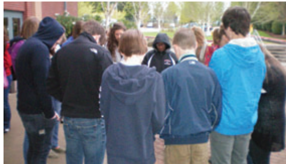
Students gathered for the National Day of Prayer on May 4, lifting up our state, nation and its leaders in prayer