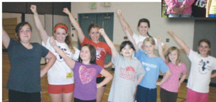
Cheer Camp participants enjoy learning songs and chants with SCS Cheerleaders