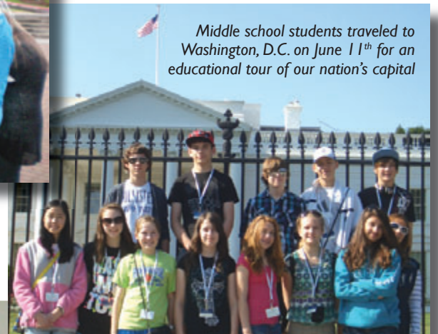
Middle school students traveled to Washington, D.C. on June 11 th for an educational tour of our nation's capital